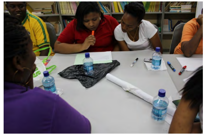
Figure 2 Participants working on the reporter sessions for the SWOT analysis

Richer members of the country's society often purchase agricultural lands within the community as means of security. The land is often left to fallow, depriving community members of the use of the land for employment and food. Asa Wright Nature Centre also purchased a substantial portion of agricultural land that is no longer available to the community. The community