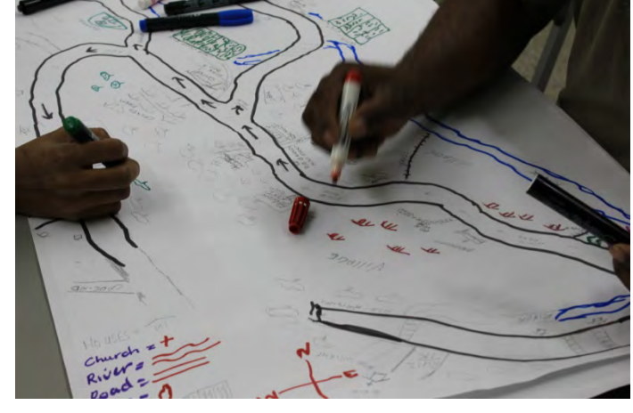
Figure 1 Participants working on a map of the natural resources of Heights of Aripo