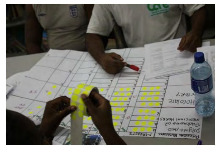
Figure 4 Participants working on the feasibility assessment

The participants used a matrix to determine the feasibility of the businesses identified in Figure 5 and section 5.2. Each business could receive a maximum of 60 points with a minimum score assigned to each category. The minimum score for the two compulsory categories ("Natural resources" and "Access to other resources") was five points. If a business failed to reach the minimum in the compulsory category, it was immediately deemed unfeasible. (See the feasibility matrix in Appendix 3).