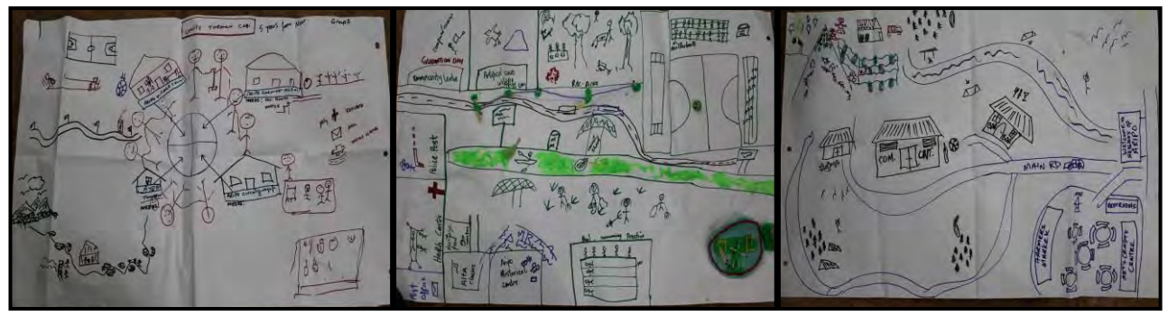
Figure 3 Three visions for Heights of Aripo

Figure 2 Common elements of a vision for Heights of Aripo