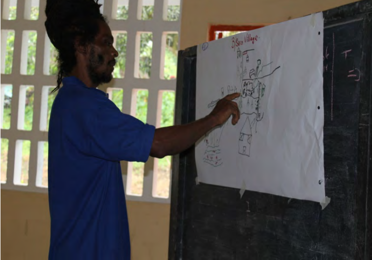
Figures 2 and 3: Presenting the vision