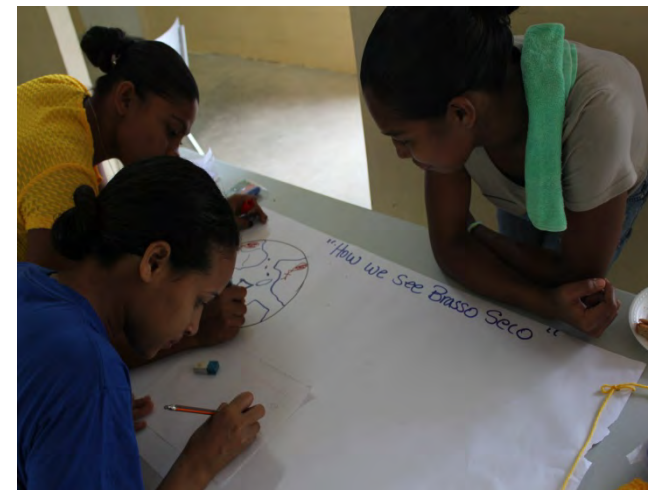
Figure 1: Participants start working on their vision

The list below summarises the elements that were common to the two visions: