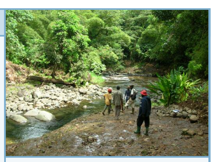
Rivers in Saint Lucia provide water for domestic use and for the agriculture industry.