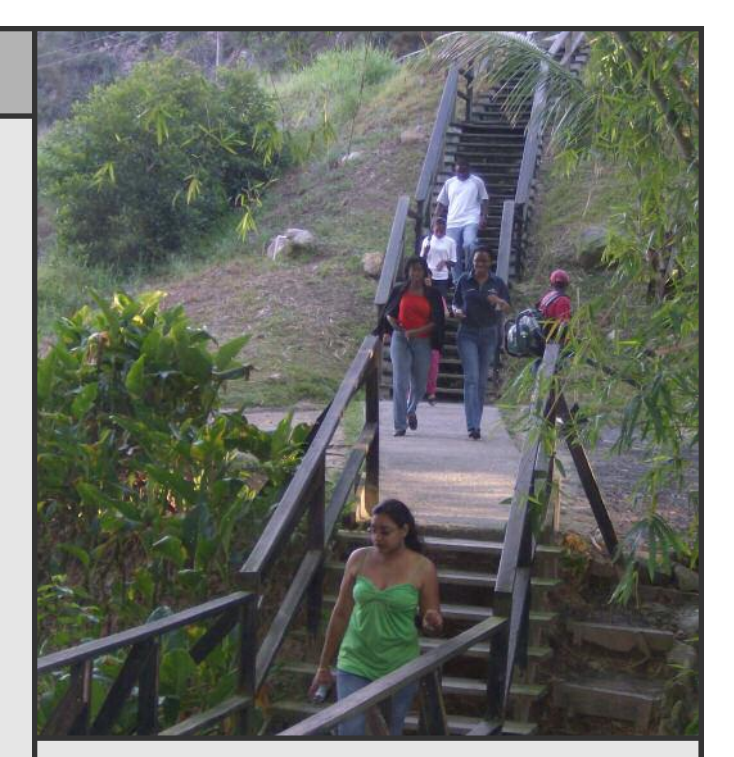
Infrastructure provides access and shelter and is integral to supporting many other sectors.