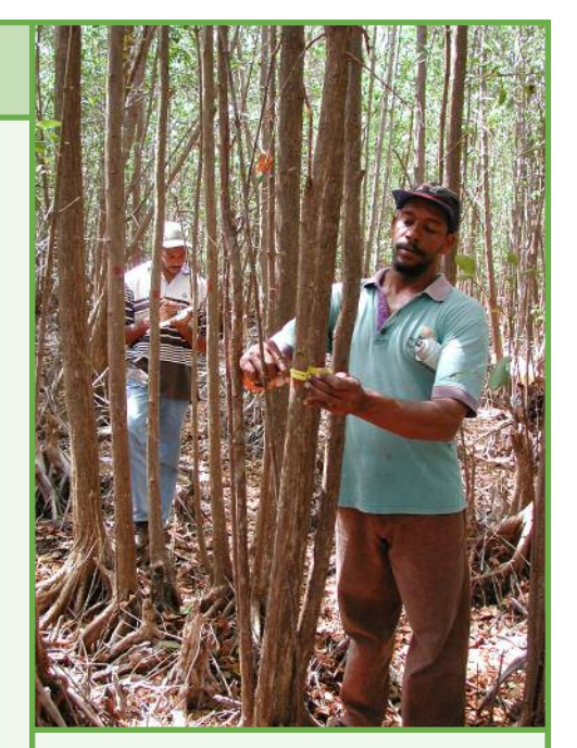
Mangrove forest can serve as costal defences against intense storm surges.