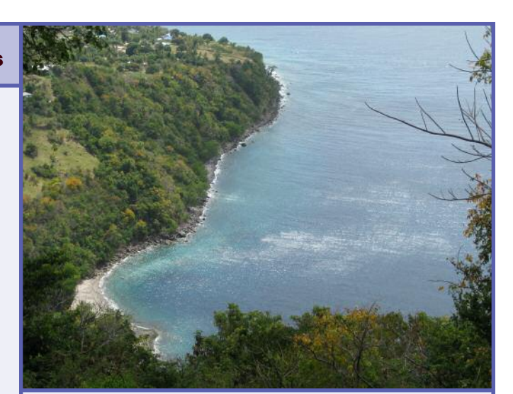
A view of Fonds Gens Libre from the Piton reminds us of the importance of coastal resources in the history of slavery in the Caribbean.