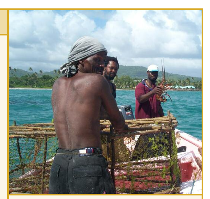
Climate change can negatively impact the size and availability of catch for fishers.

Advocate through key policy makers for amendments to the land use policy to more effectively address the impacts of climate change on agriculture which devotes land fairly to agriculture and provides green spaces.