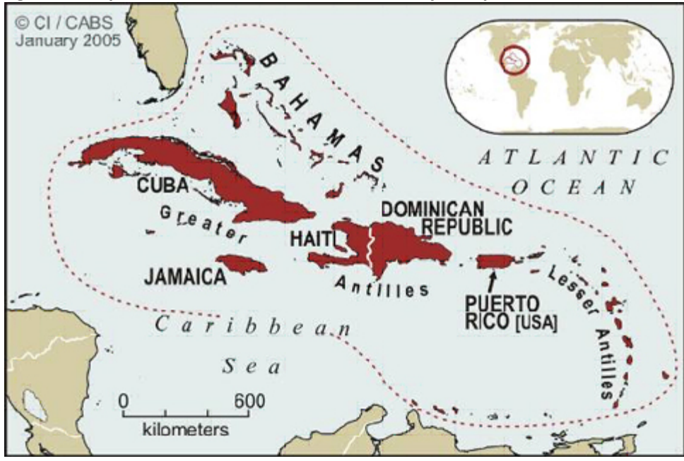
Figure 1: Map of the Caribbean islands Biodiversity Hotspot

The Critical Ecosystem Partnership Fund (CEPF) <u>Caribbean islands programme</u> is a joint initiative of l'Agence Française de Développement, Conservation International, the European Union, the Global Environment Facility, the Government of Japan, the John D. and Catherine T. MacArthur Foundation, and the World Bank. The goal of the CEPF is to support the work of civil society in developing and implementing conservation strategies, as well as in raising public awareness on the implications of loss of biodiversity. The Caribbean Natural Resources Institute (CANARI), in its capacity as the Regional Implementation Team (RIT) for the Critical Ecosystem Partnership Fund (CEPF) for the Caribbean Islands Biodiversity Hotspot, is managing a US$6.9 million grant fund to support civil society's contribution to biodiversity conservation in eleven Caribbean islands for 2010-2015. Countries eligible for CEPF support in the region are: Antigua and Barbuda, Barbados, The Bahamas, Dominica, Dominican Republic, Grenada, Haiti, Jamaica, Saint Lucia, St. Kitts & Nevis and St. Vincent and the Grenadines.